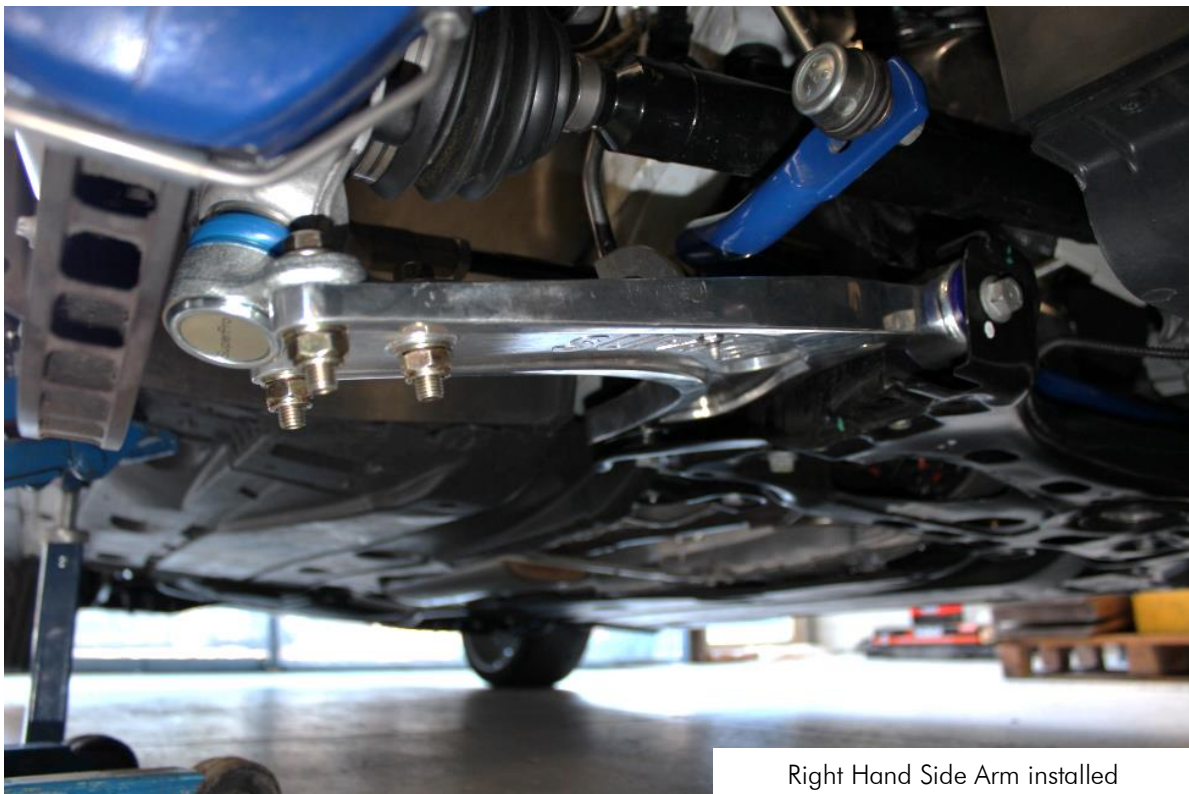
Right Hand Side Arm installed