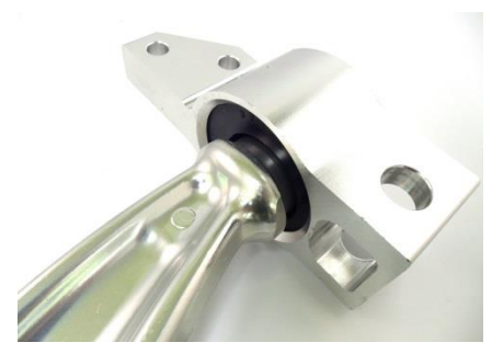
Lubricate bushing assembly