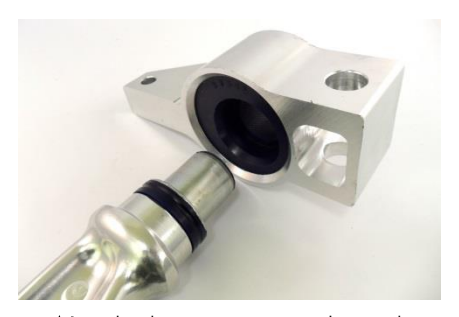
Note: bushing comes complete with housing left hand shown