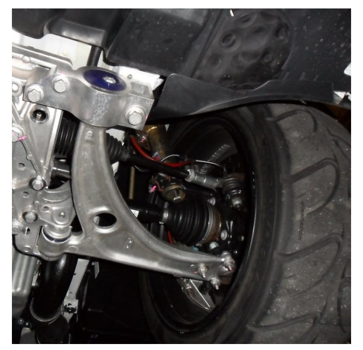
Figure 03 - View of underside of car right hand side shown with arm assembly installed